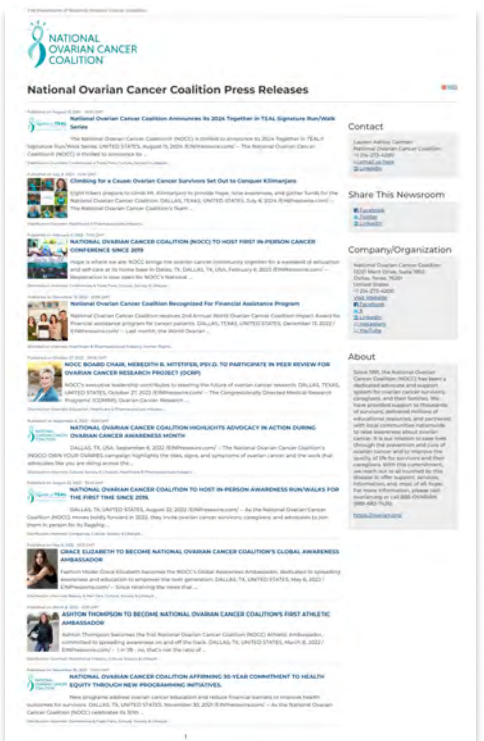
National Ovarian Cancer Coalition Newsroom