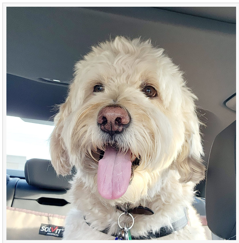
Plato the therapy dog

This press release can be viewed online at: https://www.einpresswire.com/article/805580505