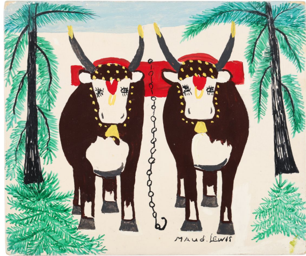
Mixed media on beaverboard signed by folk art icon Maud Lewis (Nova Scotia, 1903-1970), titled Oxen in Winter, an image that spanned three decades and dated to 1969-70 (CA$17,700).