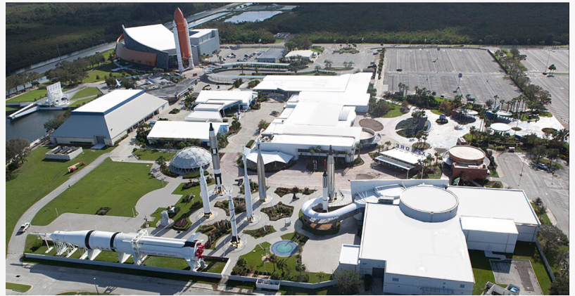
Aerial view of Kennedy Space Center rooftops after restoration

and SILICONE Roof Restoration Coating to multiple buildings at the Kennedy Space Center. Among these structures are the iconic facilities housing the Saturn V rocket and the Atlantis space shuttle — two of the most significant artifacts in space exploration history.