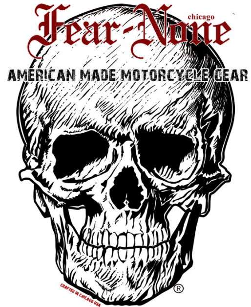
FEAR-NONE Motorcycle Gear's famed Skull Collection