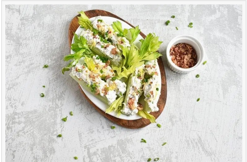
Fresh celery sticks filled with cream cheese and topped with walnuts—one of many easy, elegant appetizers for party menus on cook.me.

Examples include healthy sides for chicken , creative appetizers for party events, and simple vegetarian desserts, all designed with ingredient availability and cost in mind.