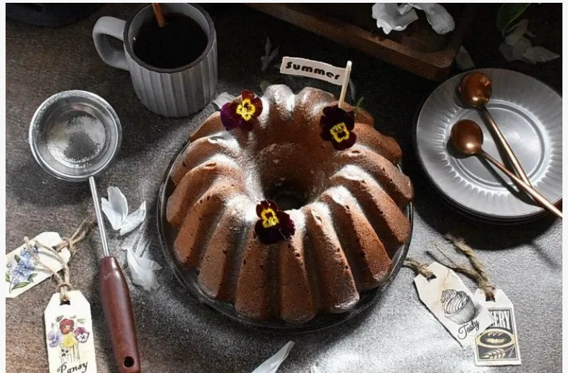
A beautifully baked summer bundt cake topped with edible flowers—perfect for light and affordable homemade desserts.