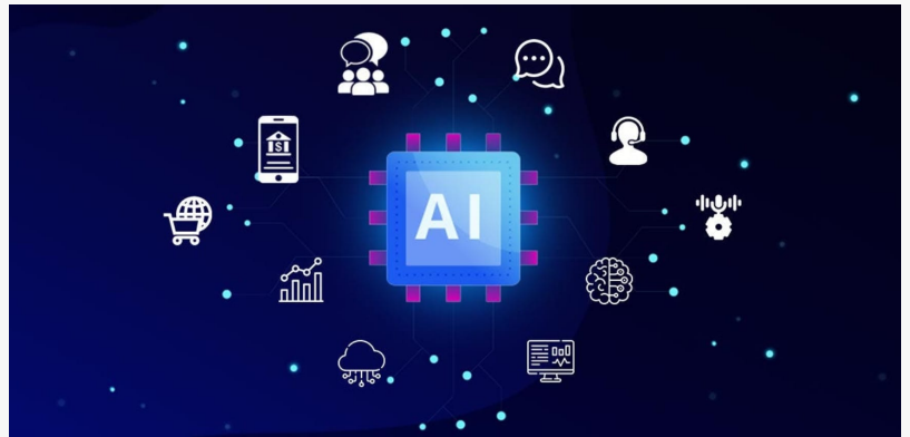
AI Agent Development Company | Amar InfoTech