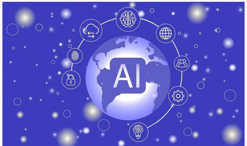
How To Create an AI Agent