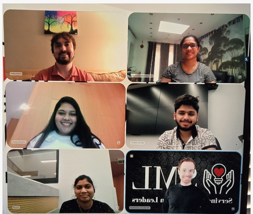
Group 2 of SML's Soft-Launch Introduction to Leadership Course Graduation

GREENVILLE, SC, UNITED STATES, April 14, 2025 /EINPresswire.com/ -- Following a successful soft launch, SML Consultive announces the official release of its Introduction to Leadership Certification , a direct-to-leader program designed for aspiring, emerging, and advancing leaders. This 10-week virtual course combines live instruction, collaborative exercises, and actionable tools to empower leaders at all levels—without requiring workplace permission or time off.