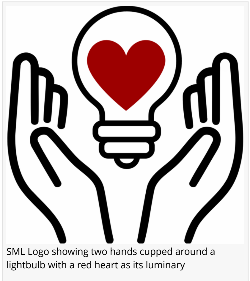
SML Logo showing two hands cupped around a lightbulb with a red heart as its luminary

Visit https://servantmindedleadership.com/intro-to-leadership-certification/ to enroll. Limited seats available.