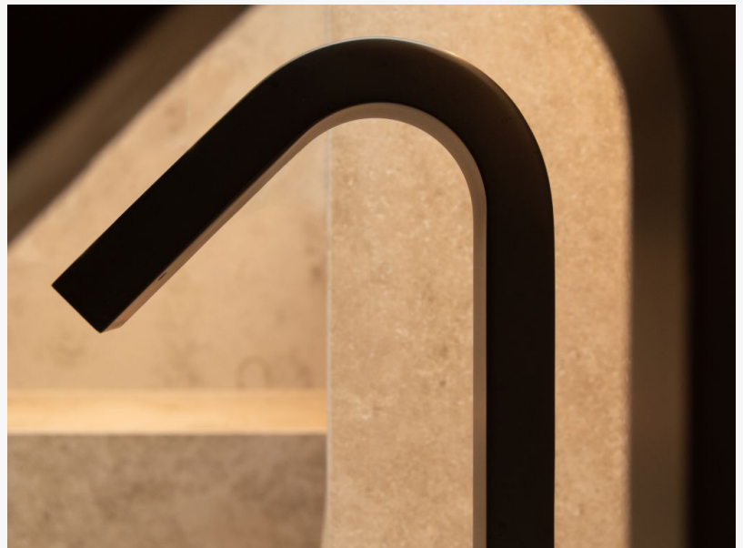
All-In-One Up Close