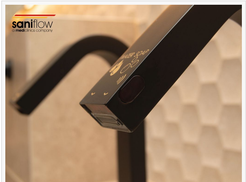
All-In-One Completely Integrated Faucet System

MIAMI, FL, UNITED STATES, April 11, 2025 /EINPresswire.com/ -- Saniflow Corp. , a leading provider of innovative and hygienic restroom solutions, today announced the launch of its popular All-In-One Faucet System in a sophisticated new black chrome brass finish. Building on the success of its original bright chrome model, this new aesthetic option offers architects, designers, and facility managers an even more stylish and contemporary choice for high-traffic restrooms.