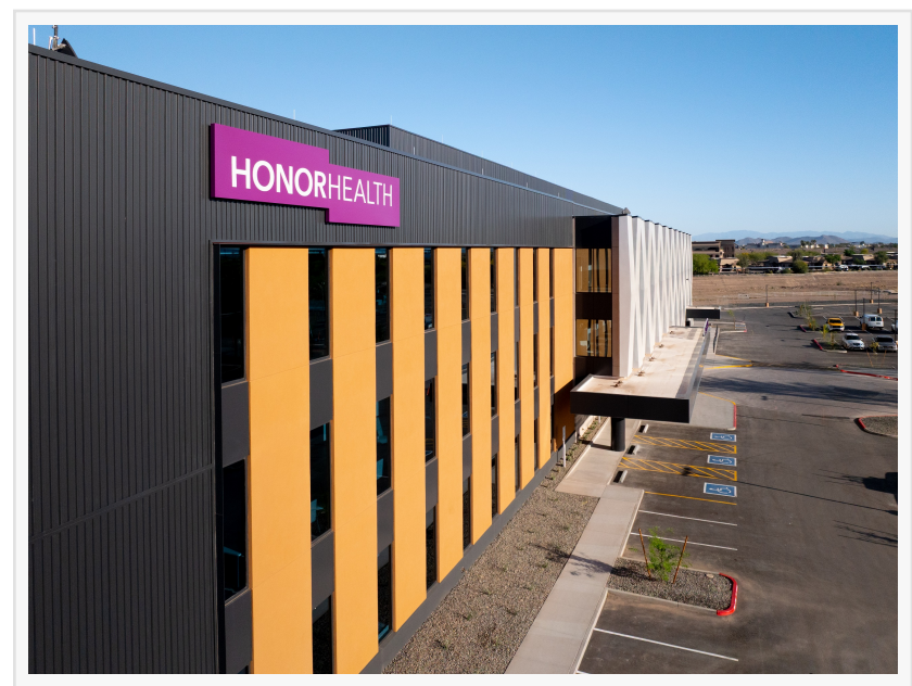
HonorHealth Medical Campus at Peoria exterior