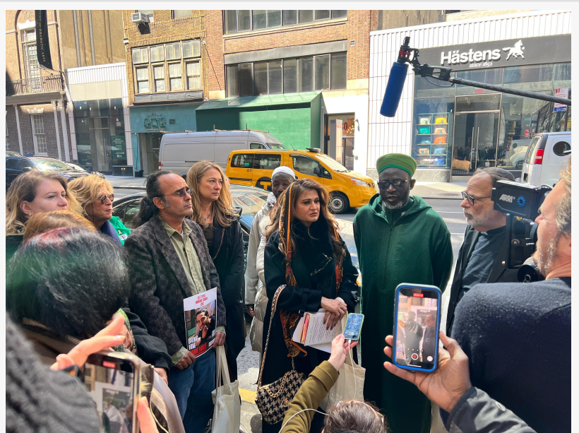
Press Briefing with Hostages