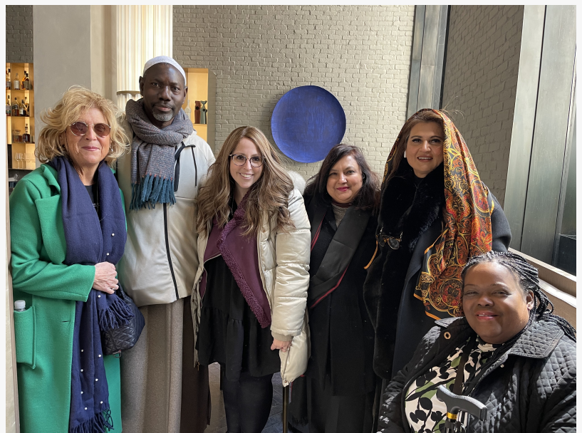
Muslim, Jewish, and Christian Leaders Unite

The gathering gave families a platform to share their pain, express urgent appeals, and receive support from religious and civic leaders committed to peace, justice, and human dignity. Each