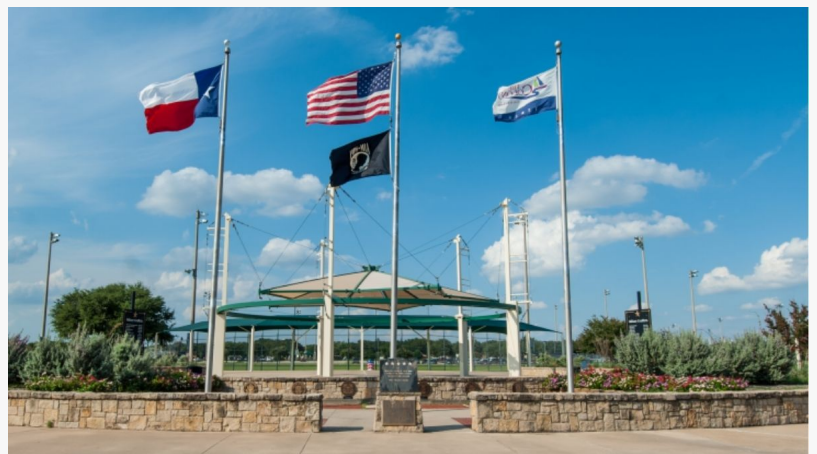
The Athletic Club - The Colony was formerly named The Colony Five Star Complex