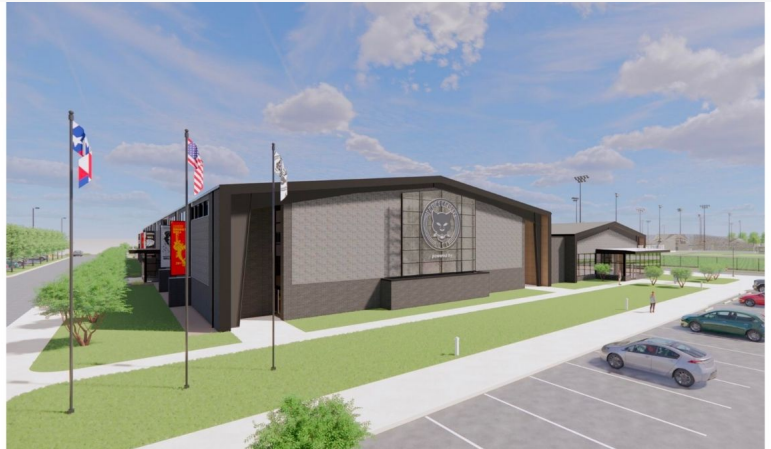
Future 75,000 sq ft indoor sports & entertainment facility at The Athletic Club - The Colony

THE COLONY, TX, UNITED STATES, April 10, 2025 /EINPresswire.com/ -- The Athletic Club – is proud to announce the start of Phase II in The Colony, a soon-to-be-built 75,000 sq ft indoor facility and a strategic partnership with High Level Promotions (HLP) to lead and manage all sponsorship sales and naming rights opportunities for its growing campus including the naming rights for the overall campus and the new 75,000 sq ft indoor facility.