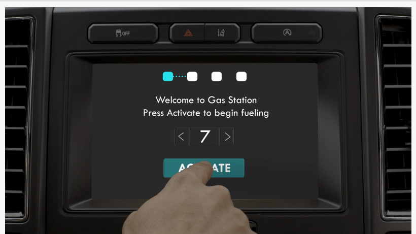
Sheeva.AI lets you activate gas pumps from inside the car

TYSONS CORNER, VA, UNITED STATES, April 9, 2025 /EINPresswire.com/ -- Sunoco LP (NYSE: SUN) and Sheeva.AI today announced a strategic partnership to enable the in-car SheevaConnect™ platform across Sunoco's network of more than 5,700 retail fuel outlets throughout North America.