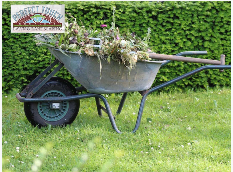
Commercial Spring Cleaning Services WA-

As commercial properties shift from winter dormancy to peak seasonal activity, landscape conditions become a critical operational consideration. Unaddressed debris accumulation, soil compaction, and residual damage from winter conditions can undermine a site's visual integrity and long-term sustainability. Through its Commercial Spring Cleanup in Everett, Perfect Touch Landscaping applies a data-driven methodology to mitigate these transitional challenges, enhancing soil