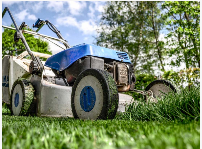
Lawn Care Services in Everett.