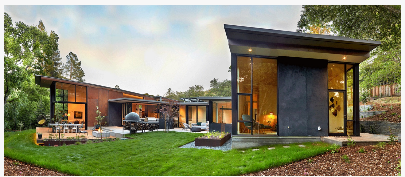
Reciprocity House Panorama view from Creek

Terrace House - Gunkel Architecture Perched on a hillside in Point Richmond, this contemporary home features a reverse floor plan to maximize stunning bay views. Retractable window walls and expansive decks blur the line between indoor and outdoor living, while a cozy sunken lounge fosters connectivity between levels.