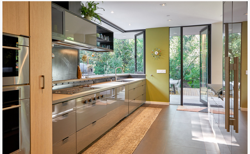
Indoor outdoor living. Kitchen easily connects to outdoor spaces

North Oakland Residence - Aaron Goldman, Architect, Designer: Evans Design Studio A thoughtful modernization of a 1906 bungalow, this project preserves historical charm while introducing contemporary openness. The redesign enhances natural light and fosters a seamless flow between indoor spaces and the private rear garden, embodying the essence of modern living.