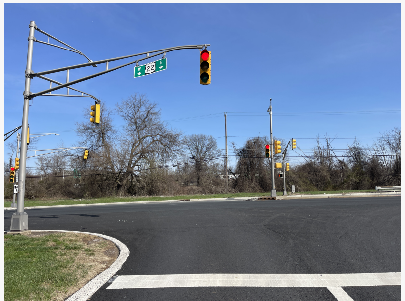
2.45+/- Acre Lot, Clinton Twp, NJ