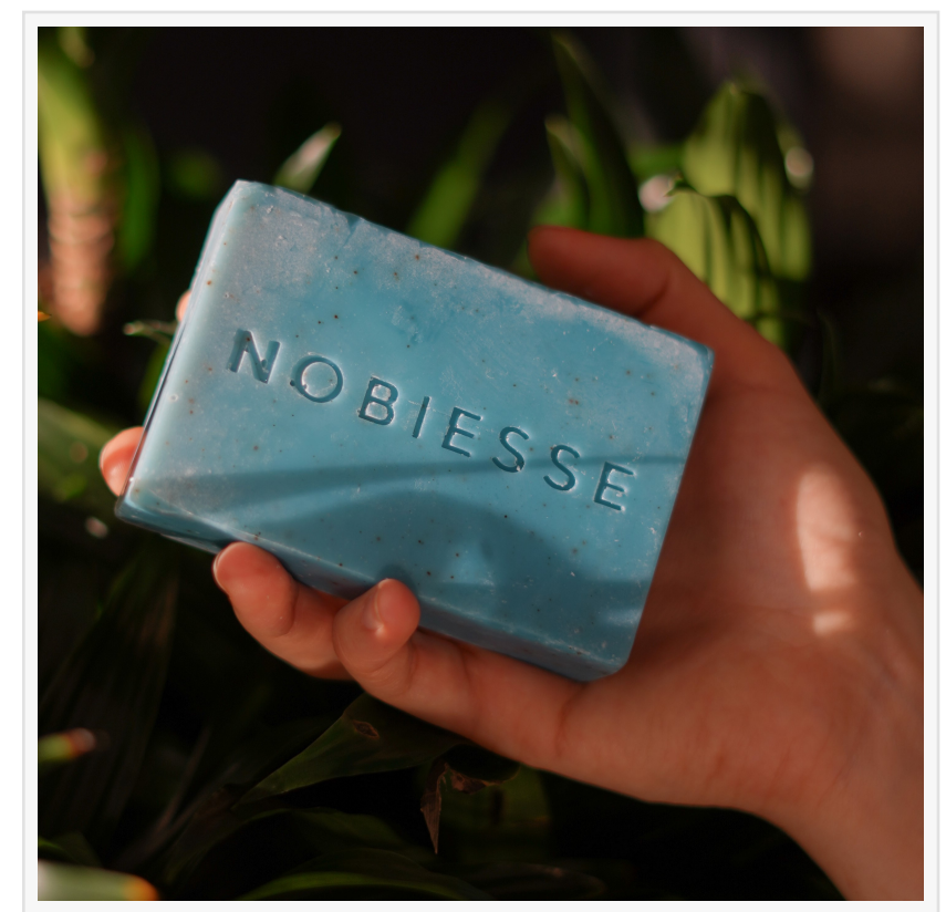
Nobiesse Methylene Blue Bar Soap Exclusive Anti-Oxidant Bath Shower

The bar soap component of the kit provides an equally important role. Formulated using olive oil, coconut oil, and shea butter, the soap gently cleanses without stripping the skin's moisture barrier — a common problem with conventional soaps that use sulfates or alcohol-based ingredients.