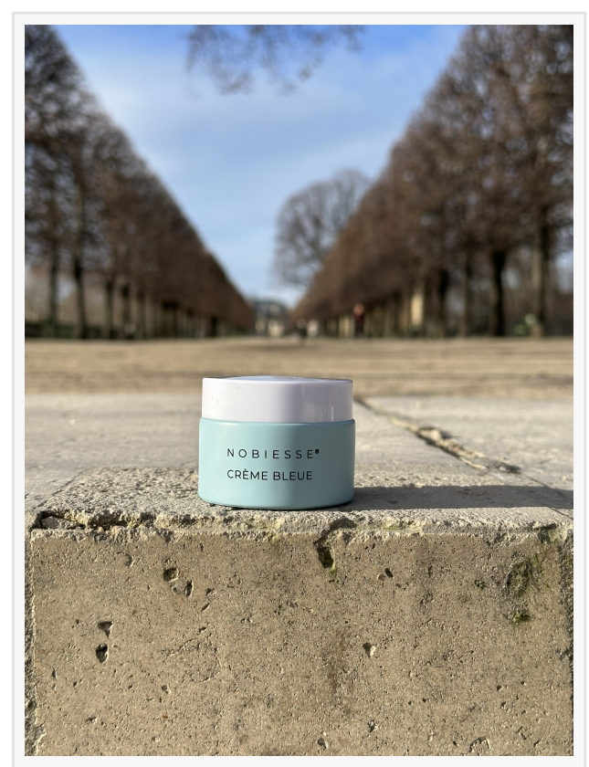
Nobiesse Creme Bleue with Methylene Blue

Developed with input from dermatological research and grounded in emerging science, the Nobiesse Sun & Ski Kit integrates traditional skincare practices with next-generation antioxidant ingredients. It remains a core offering in the company's expanding product portfolio of toxin-free formulations, and its continued relevance has become more apparent as consumers seek safe and effective products for transitional weather and year-round outdoor activities.