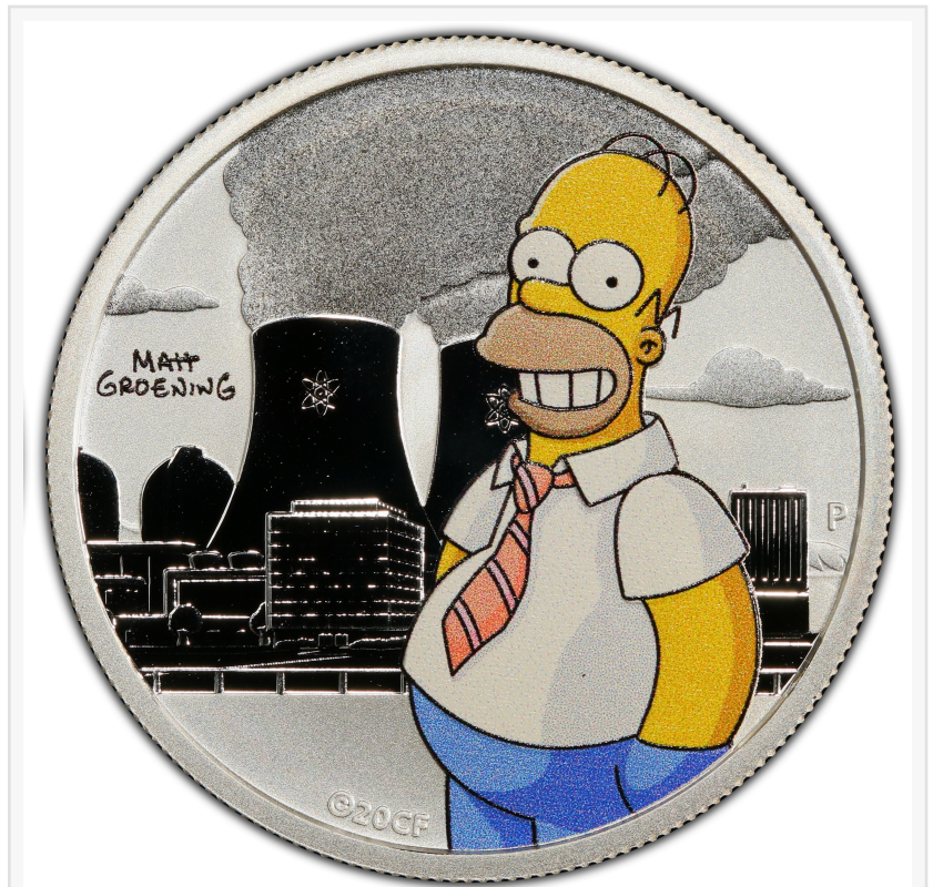
Homer Simpson has been depicted on coins struck by the Perth Mint for Tuvalu.

Observed every third week of April, National Coin Week was established a century ago to attract the general public to the enjoyable hobby of coin collecting. For additional information about the