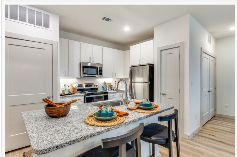
Their open kitchens include a modern island, stainless steel appliances, and a seamless flow into the living room.

Designed for both comfort and convenience, Tobias Place offers beautifully crafted 1 & 2-bedroom apartment homes with modern features and thoughtful details, all at a price that makes stylish living more attainable. These spacious residences, ranging up to 1,157 sq. ft., feature stainless steel appliances, wood-style flooring, abundant natural light, and in-unit washers and dryers. Select homes elevate the experience with kitchen islands, glass-enclosed showers, spacious pantries, and private patios or balconies, blending style with functionality. Beyond the doorstep, Tobias Place provides a resort-inspired lifestyle, featuring a pool with cabanas and outdoor seating, a state-of-the-art fitness center, coworking spaces, a stylish resident lounge, and a dedicated playground.