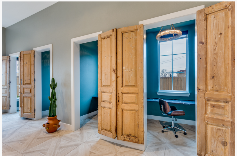
Workrooms with warm wooden design and a touch of Texas charm for a cozy, productive space.