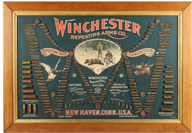
American circa 1897 Winchester Double "W" cartridge display board No. 291 in an oak frame, 40 inches by 57 ½ inches, in very good condition with strong colors (CA$79,650).

• A Winchester 1902 Double "W" cartridge board lithograph – the last of the early cartridge boards, entirely made up in a paper version and, unlike its predecessor 1897 board, there are no dummy cartridges attached. These 1902 boards don't show up as often as the 1897 boards and are rarer. 31 ¼ inches by 49 ¼ inches (sight) ($18,880).