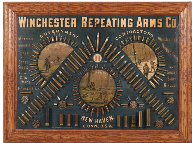
Winchester 1888 Inverted "V" cartridge display board – slightly altered from the 1886 version (and rarer, too) by the addition of two additional rifle cartridges (CA$100,300).