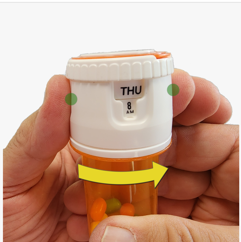
Meticap, a reusable medication timing cap, tracks the timing of your next dose with a turn of the vial towards the right to advance the hours.

In addition to providing Meticap to patients, pharmacists play a vital role in educating them about the importance of medication adherence and how Meticap can help them stay on track with their treatment. Pharmacists can offer personalized guidance on how to use Meticap effectively, empowering patients to take control of their treatment plan with confidence.