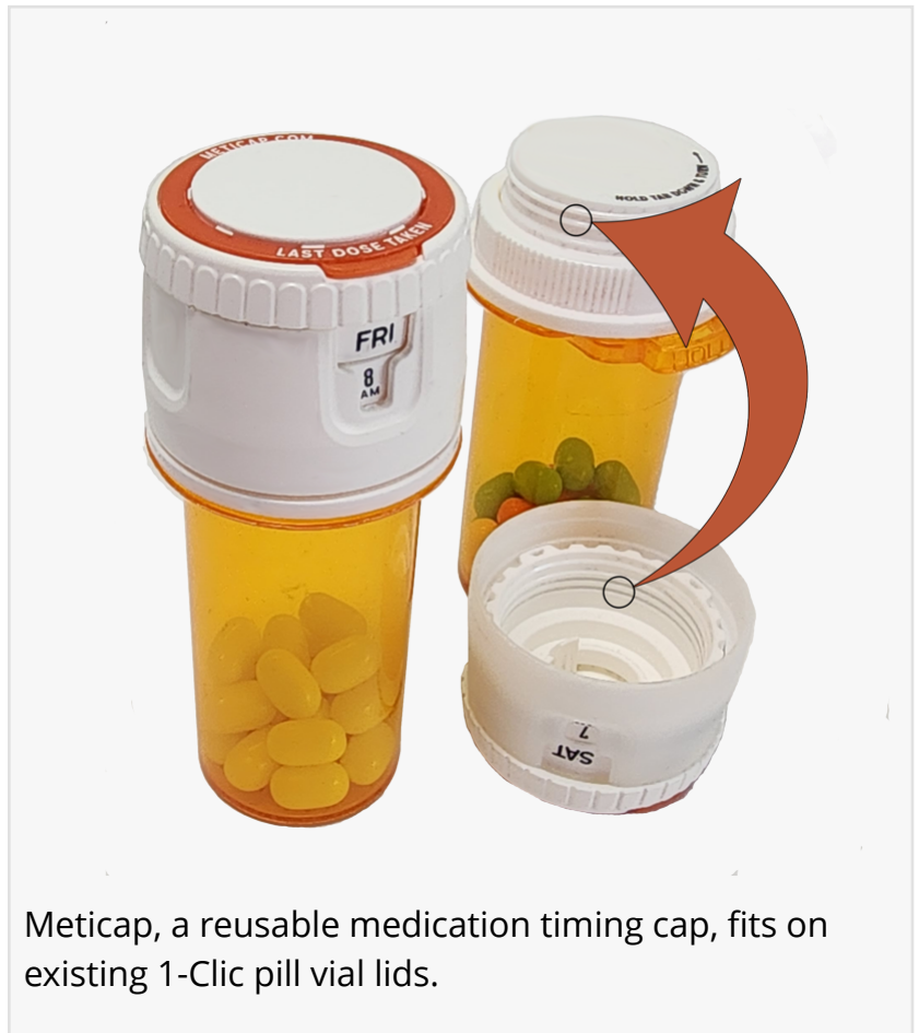
Meticap, a reusable medication timing cap, fits on existing 1-Click pill vial lids.

PHILADELPHIA, PA, UNITED STATES, April 2, 2025 /EINPresswire.com/ -- Adherence to prescribed medication regimens is a critical component of healthcare, yet it often presents challenges for patients. In recent developments, pharmacists now have access to a revolutionary tool called Meticap , designed to support patients in taking their medications consistently and accurately. Let's explore how Meticap integrates seamlessly into pharmacists' efforts to promote medication adherence and improve customer retention for independent pharmacies.