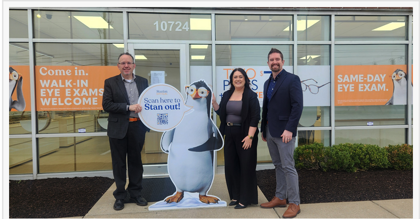
Stanton Optical Avon Staff Celebrating Grand Opening Ceremony

AVON, IN, UNITED STATES, April 4, 2025 /EINPresswire.com/ -- Stanton Optical, a leader in affordable and accessible vision care, proudly announces the grand opening of its newest location in Avon at 10724 E US Hwy. 36. This marks the company's eighth store in Indiana, making cutting-edge eye care and affordable eyewear even more convenient for families, just in time for spring.