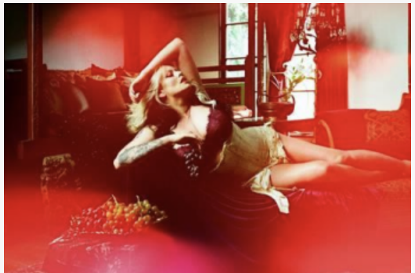
Stormy Daniels in CANDYLAND