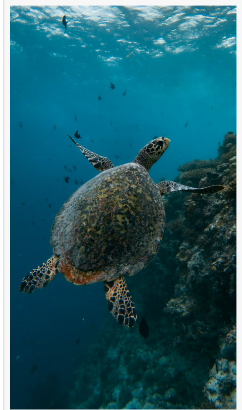
Turtle captured during a dive at Ellaidhoo Maldives by Cinnamon