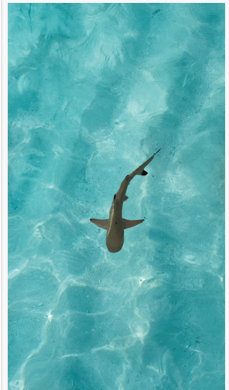
Reef shark at Ellaidhoo's house reef