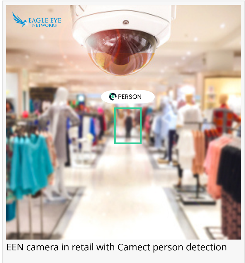
EEN camera in retail with Camect person detection

The Camect Smart Camera Hub maintains the highest level of accuracy in detecting known