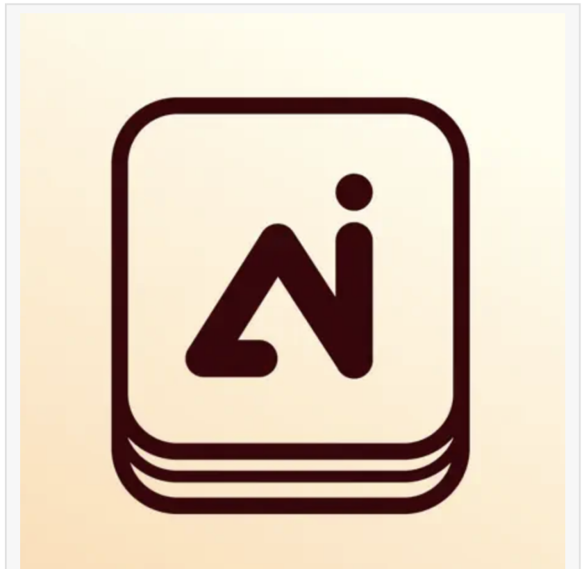
AI Notebook logo

Podcast-Style Reviews: Turn key discussions into audio summaries for on-the-go learning.