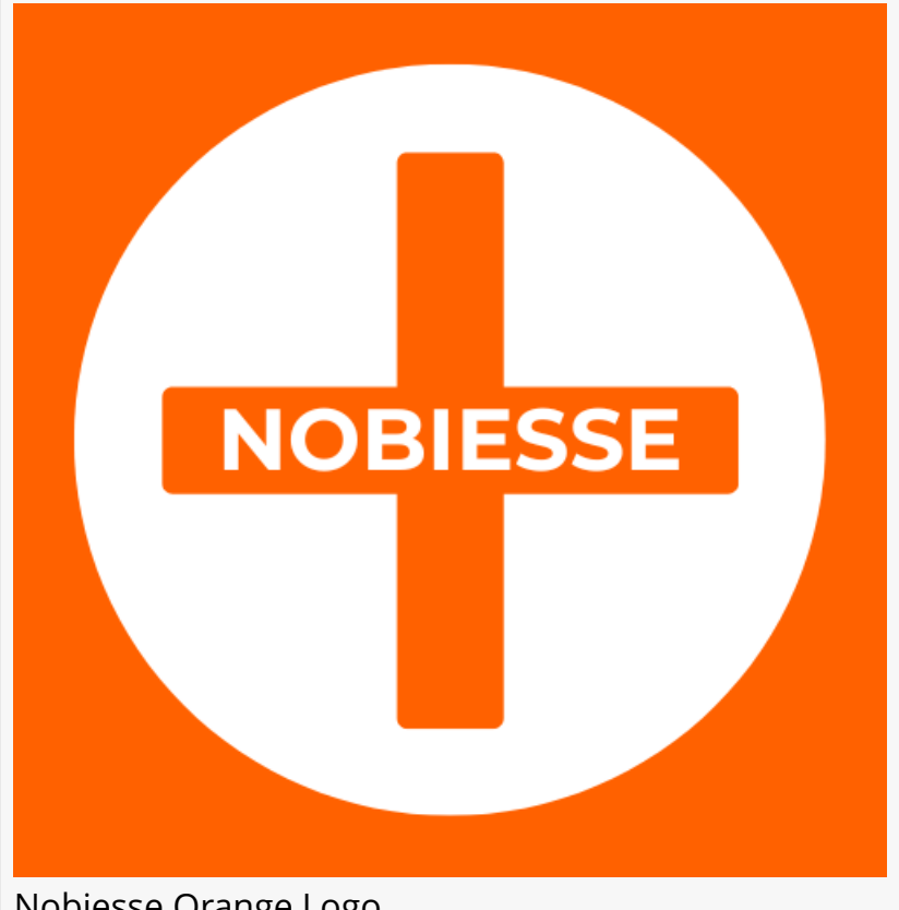
Nobiesse Orange Logo