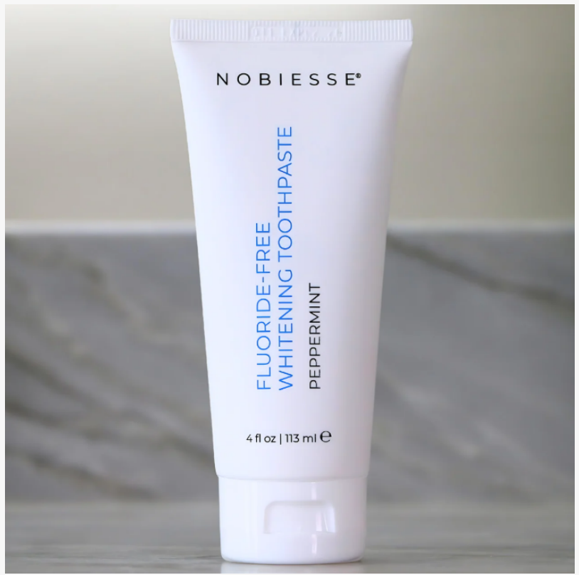
fluoride-free whitening toothpaste

Eco-Friendly Cleaning Bundle - A non-toxic, biodegradable collection designed for effective