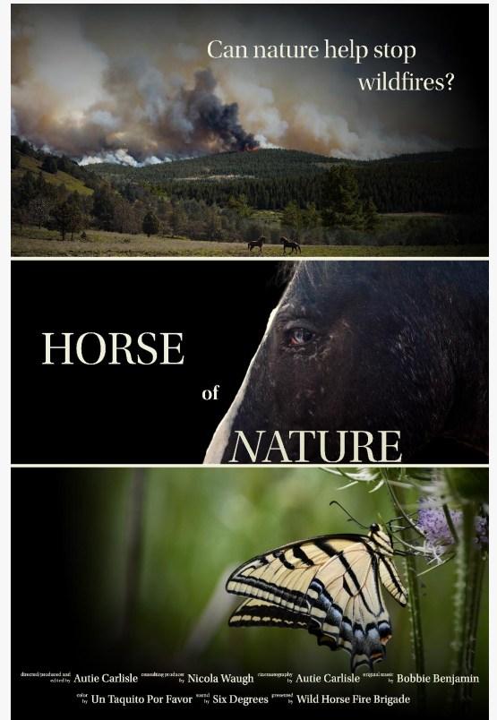
HORSE of NATURE poster