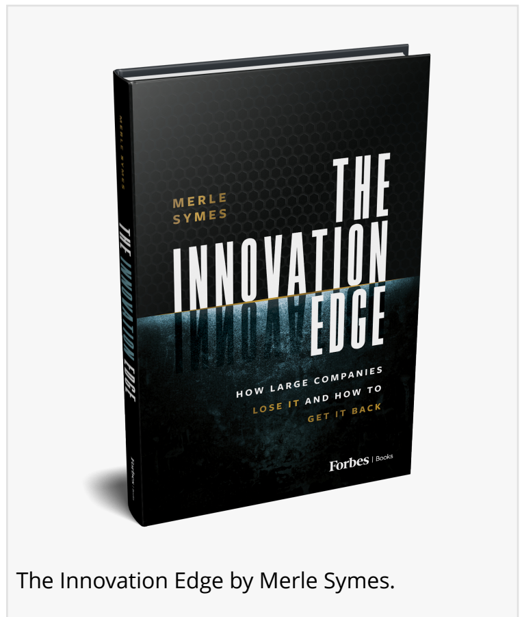
The Innovation Edge by Merle Symes.

"Large organizations cannot just emulate start-ups and new ventures because there are true fundamental differences between them," Symes writes. "Large, mature organizations must develop an understanding of certain core principles regarding innovation. They then must essentially reinvent how to create those same types of breakthrough innovations within their corporate environment."