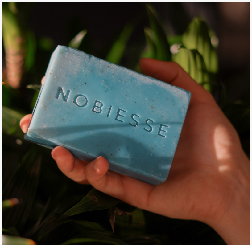
Nobiesse Methylene Blue Bar Soap Exclusive Anti-Oxidant Bath Shower

"The goal of Nobiesse has always been to create products that nourish the skin while also