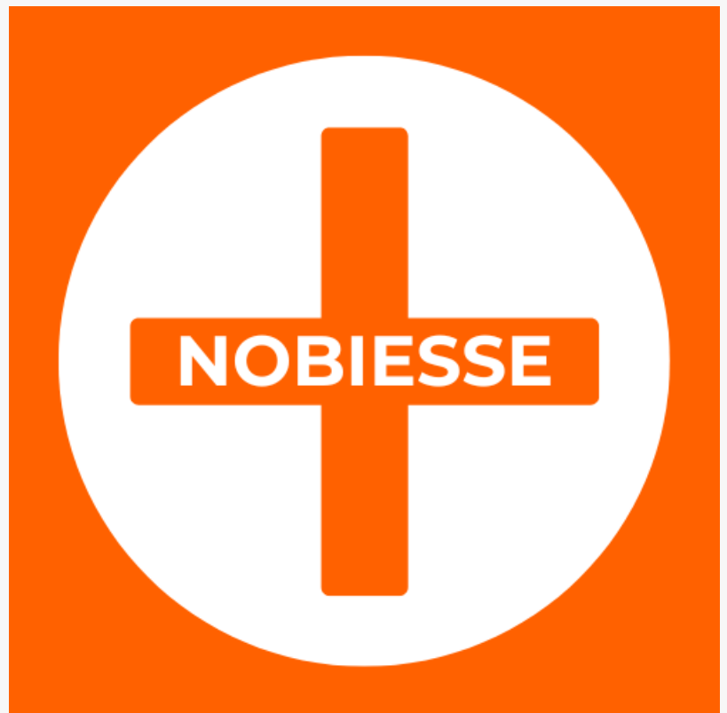
Nobiesse Orange Logo