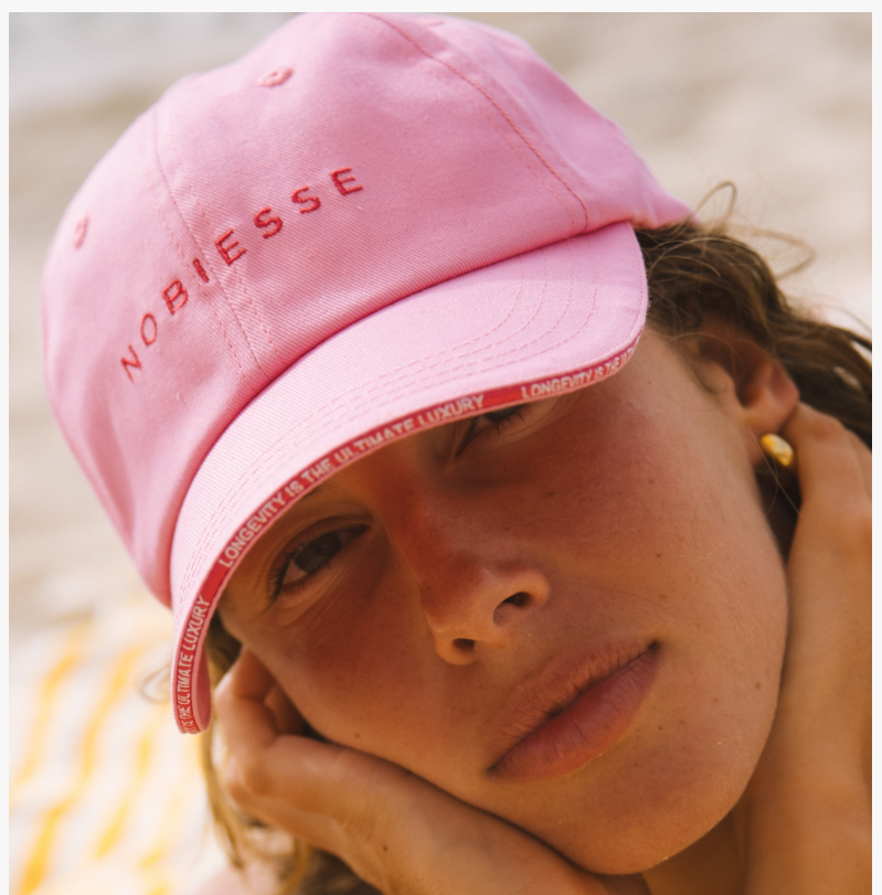
Nobiesse - Longevity is the Ultimate Luxury

Botanical Extracts: Infuse the soaps with antioxidants that help protect the skin from environmental stressors.