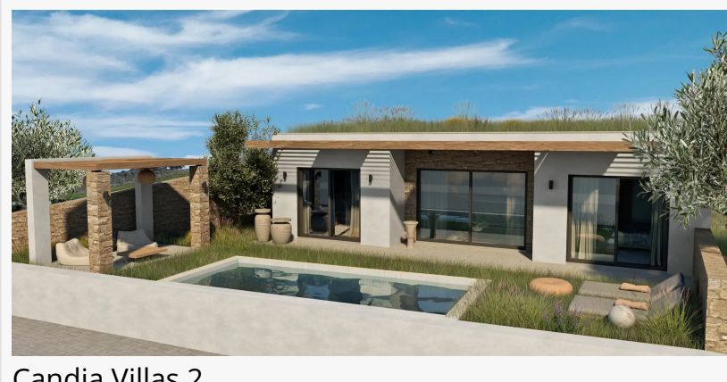
Candia Villas 2

The shift of homebuilders towards Crete's vacation home market in recent