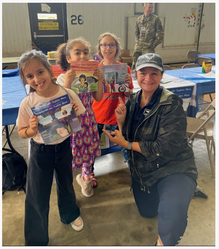
Captain Mama aviation books inspire the next generation of woman aviators, bilingually

Monday through Wednesday ahead of the conference, she will deliver assemblies and writing workshops to inspire local scholars in Weld County School District 6 where she attended school as a child.