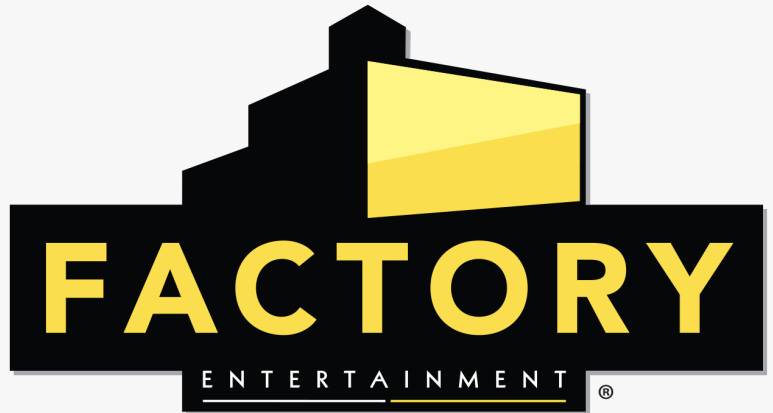
Factory Entertainment Logo

This press release can be viewed online at: https://www.einpresswire.com/article/795622177