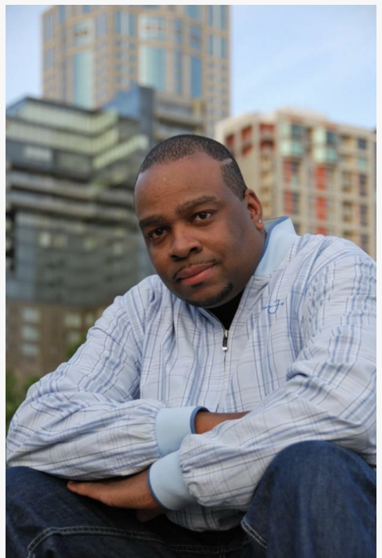
Quincy Q - Hip Hop Artist

Fans can connect with Quincy Q and explore more of his work at https://quincyq.hearnow.com/ or visit the label's site at https://www.musicnationlive.com/ . The single is available on major streaming platforms, including Spotify, Apple Music, Amazon Music, and SoundCloud.