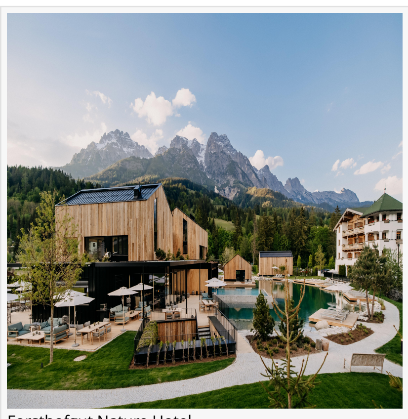
Forsthofgut Nature Hotel

Whether it's relaxing with rejuvenating wellness treatments in the Austrian Alps, enjoying private beachfront luxury in Turks & Caicos, or exploring the quiet beauty of Cape Town's shoulder season, each destination presents carefully crafted offers that highlight their unique locations and amenities.