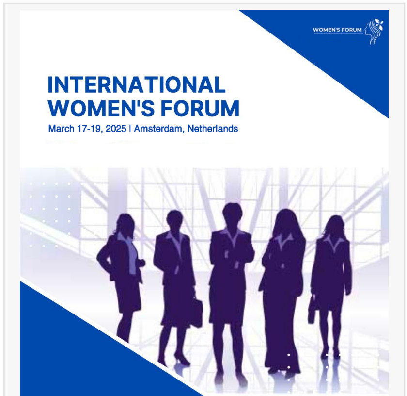
International Women's Forum

She paid special attention to the role of war as a catalyst for change. War has brought enormous challenges but has also opened new