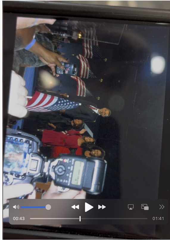
Travelingwiki in Chicago with Presidential Protection for US Pres. Obama & Biden

follows extensive recent work in sports, travel and beyond. Recently, TravelingWiki Leadership engaged at Super Bowl LIX, the NFL Combine (2025) and was covered via multiple networks in Iowa and via Erie's WICU (NBC News) & WSEE (CBS News & CW) profiling TravelingWiki