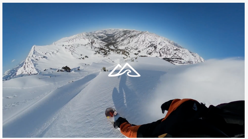
SENDY: Built by Athletes for Athletes

The outdoor gear rental industry is experiencing massive growth, fueled by rising consumer demand for: