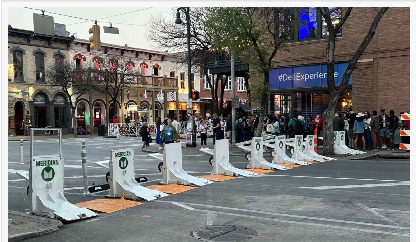
SXSW Street Closure

AUSTIN, TX, UNITED STATES, March 18, 2025 /EINPresswire.com/ -- A major overhaul of pedestrian safety at the South by Southwest Festival (SXSW) resulted in Meridian Rapid Defense Group ("Meridian") being invited to create secure zones around the dozens of events that took place over a two week period.