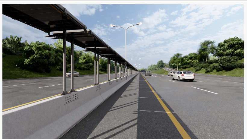
E2SOL Solar Median Micro-Grid

To address these issues, E2SOL's SSHM integrates innovative solar generation, microgrid capabilities, and Yotta's new decentralized energy storage solution, Yotta Block, to create a