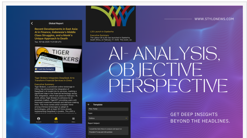
Stylo News AI Analysis

ProWave AI, LLC, the developer of Stylo News, is a veteran-owned technology company based in