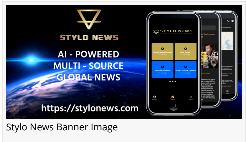
Stylo News Banner Image

Stylo News' advanced AI agents revolutionize the way news is consumed by seamlessly searching and analyzing both traditional news sources and social media in real time. These AI-driven tools generate comprehensive reports faster and more effectively than manual aggregation or reading