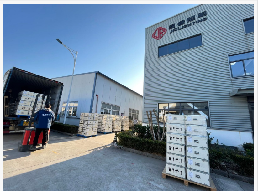
jr lighting manufacture

JR Lighting's expertise spans critical lighting applications, with LED flood lights as its flagship product, complemented by solutions for infrastructure, sports venues, and urban development: