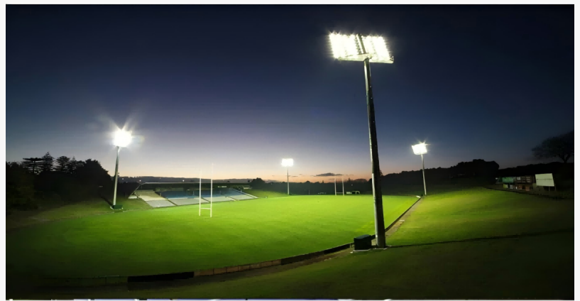
led flood light

Innovation and Sustainability: Core Values Driving Excellence