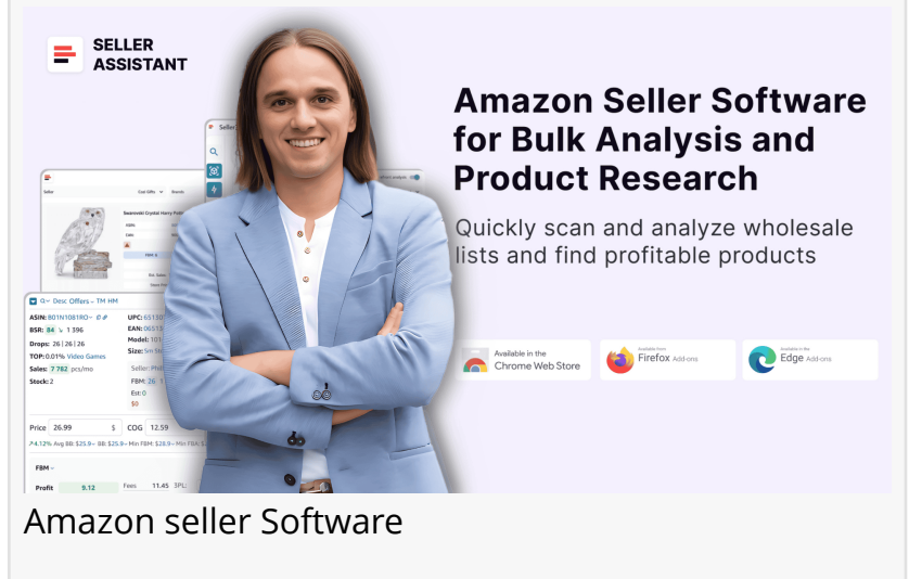
Amazon seller Software