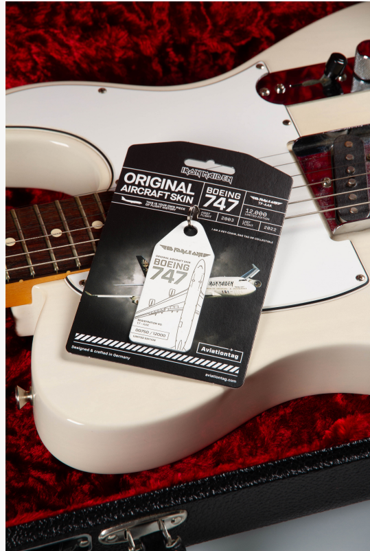
Mood photo of Aviationtag x Iron Maiden Ed Force One Tag