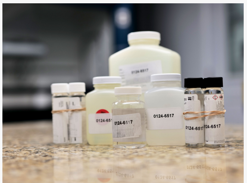
Water samples to be tested for radon and other contaminants in water

Kyle Hoylman, CEO of Protect Environmental