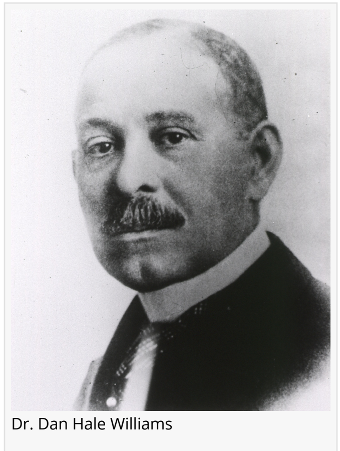
Dr. Dan Hale Williams