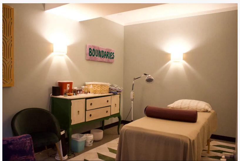
River City Wellness offers several different services at their new location.

Acupuncture, which was previously the sole service offered at River City Wellness, is founded on the concept of balance. It requires a unique approach to each patient, which ties into traditional Chinese medicine due to its overarching goal of meeting patients where they are at. The services offered at River City Wellness balance symptoms by providing support where the body's system