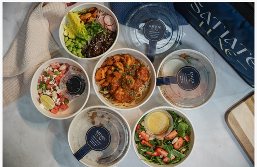
Satiat Luxe Gourmet Meal Plan