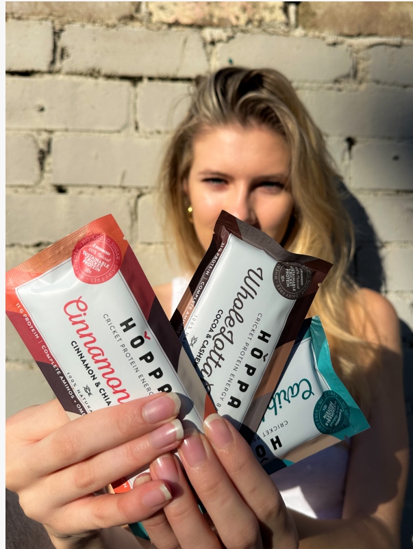
Hoppa Cricket Protein Energy Bars

Australian brand Hoppa is leading the movement with its 100% natural, minimally processed protein bars and powders. Unlike most commercial protein snacks, Hoppa's products contain