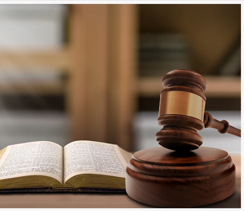
Business Immigration Law Firm.

With increasing competition and regulatory scrutiny, applicants must ensure their submissions are thorough, well-documented, and aligned with the latest requirements. This press release provides essential insights into the upcoming H1B visa application process and the revised NIW guidelines, helping professionals and employers make informed decisions.